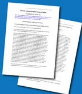
Chinese Herbal Medicine Research Abstracts