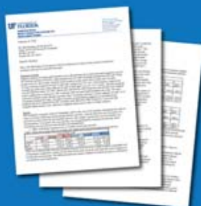
Easy Access to Research Grant Papers